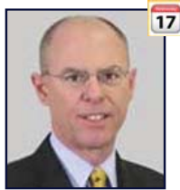
Sandy BROOK DENVER