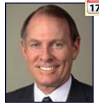
Skip NETZORG DENVER